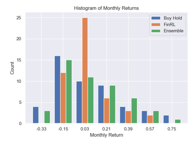
Figure 3: Histograms of monthly returns