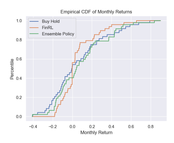
Figure 2: Empirical CDF of monthly returns

and negative sides comparing with the buy and hold returns. The ensemble method shows robust performance relative to the market performance. Returns of our proposed strategy also dominate at most quantile levels at or above 50% except being slightly behind the buy and hold strategy at 70%, showing a high concentration on the large positive returns comparing with the benchmarks. While the ensemble method underperforms the FinRL model in preventing losses, it still outperforms the buy and hold strategy at all quantile levels at or below 60%. Our ensemble method also has the highest median return among the three strategies. The distributional view shows that the returns of the ensemble method concentrate at higher values compared with both the FinRL and the buy and hold strategy, and demonstrates some extent of downside risk control compared to more cases of large losses incurred by the passive investment strategy. The results corroborate the finding that the ensemble method achieves much higher positive returns in a bullish market from the cumulative returns plot.